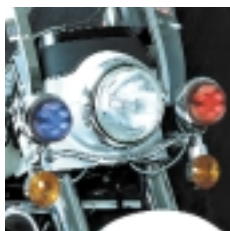
Mounted on a police motorcycle.

* Replace symbol in model number with letter indicating LED color desired: A = Amber, B = Blue, C = White, R = Red, G = Green.